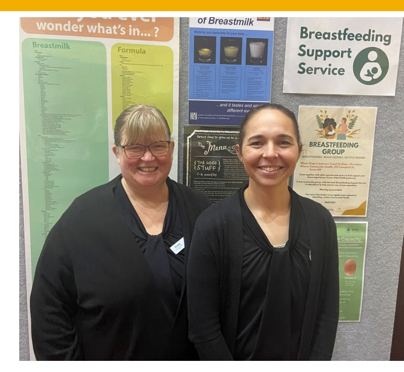
Experienced midwives available for help and support with breastfeeding